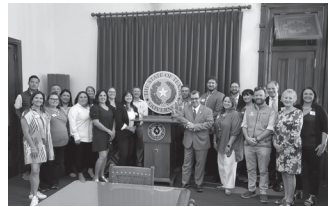
Marble Falls Delegation