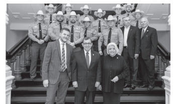
Texas Game Wardens