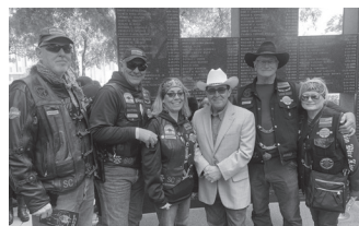
CLEAT Peace Officer Memorial Service