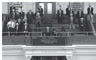
Sheriff's Association of Texas