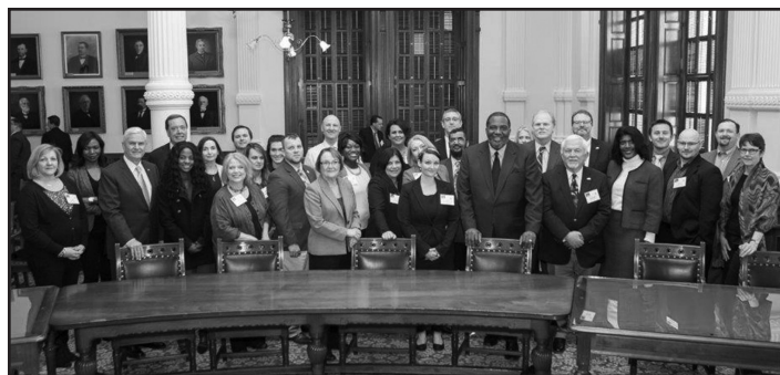
Senator West visits with business leaders during "Irving Day" at the Capitol.

Much of Texas economic success is owed to oil and gas exploration. But it was the literal explosion in the use of hydraulic fracturing, "i.e. fracking" that helped Texas shake-off the ef-