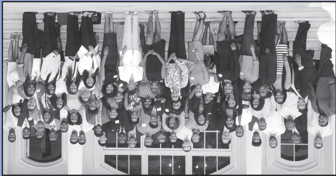
2015 Dr. Emmett J. Conrad Leadership Program

Students as young as 6 years old can experience the Texas Legislature firsthand through the "Page for a Day" Program where they see their Texas government at work as well as the lawmaking process. For information on any of these youth-related programs, please contact my office.