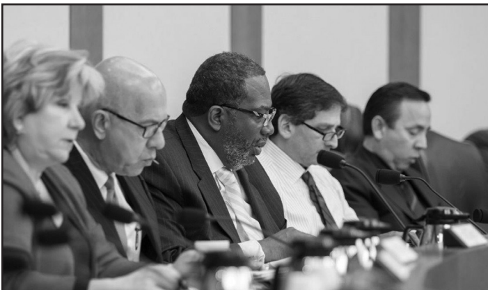
Senator West during Senate Finance Committee hearing with (l to r) Chairman Jane Nelson and Senators Whitmire, Eltife and Uresti.

Another $40.6 million is targeted for reading and math academies for K-3 teachers. The budget allocates more than $1 billion for instructional materials and expands Pre-K offerings by $118 million. Still, the Legislature did not use more of the dollars it had available.