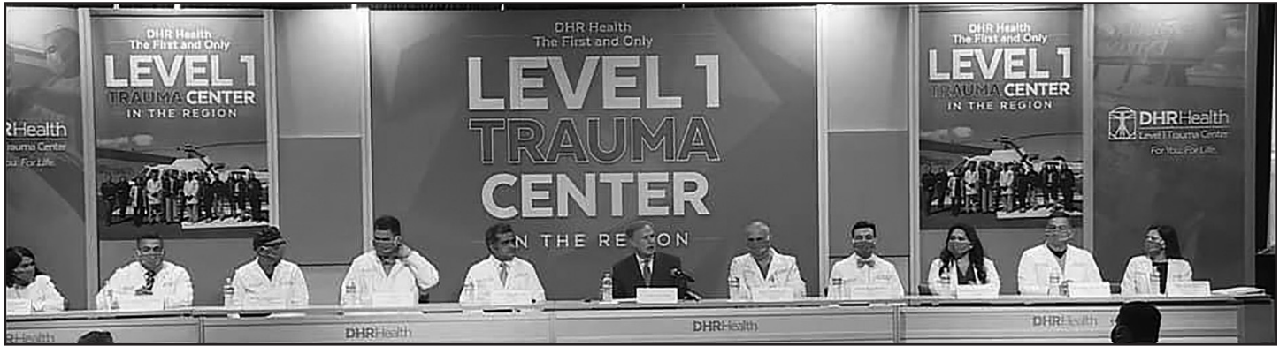
The designation of Doctors Hospital at Renaissance (DHR) in Edinburg as the first Level 1 trauma facility in the Rio Grande Valley. The Valley delegation made it one of its priorities during the 2019 legislative session to help provide funding for a Level 1 trauma facility in the RGV. In 2019, DHR was the recipient of $6 million in grants funds to be used for leveling up to a Level 1 facility.

tinues to actively conduct research on trauma. As leaders in academic healthcare in the Rio Grande Valley and with the establishment of the University of Texas Rio Grande Valley (UTRGV) and the UTRGV School of Medicine, DHR Health has become the primary teaching site for residency training programs. DHR Health is home to nine residency and fellowship training programs, including general surgery. As an American College of Surgeons (ACS) verified Level 1 Trauma Center, DHR Health provides these residents with the experience of working with severe trauma cases and prepares them to become future staff at trauma centers across our region and the country.