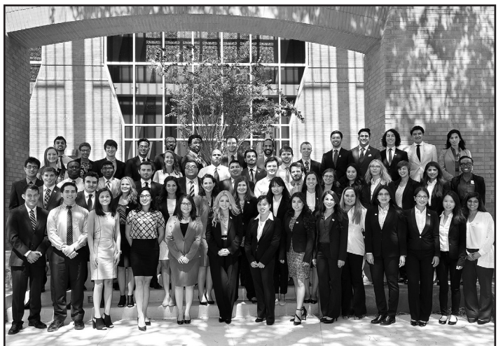
The Inaugural Class of 2020 from the UTRGV School of Medicine.

Additionally, the state budget bolsters our healthcare workforce by providing an additional $48.6 million for the Graduate Medical Education (GME) Expansion Program, bringing the total funding for GME to $199 million. This increase provides the funding needed to maintain the required 1.1 to 1 ratio of first-year residency positions to medical school graduates and helps fund doctor residency slots across the state. Since 2014, CHRISTUS Spohn in Corpus Christi has received