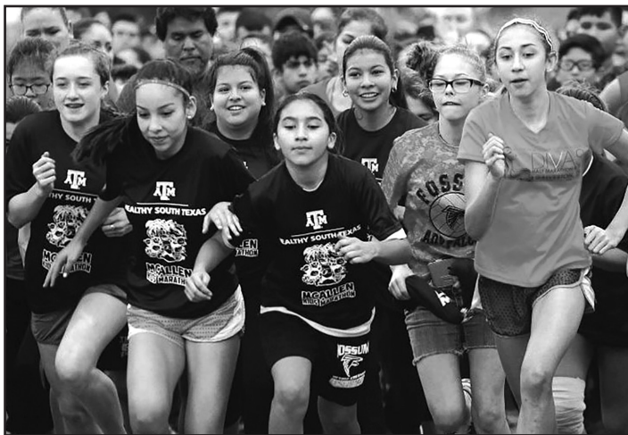
Children participating in the McAllen Kids Marathon hosted by Healthy South Texas.

GME funding becomes increasingly important as UTRGV prepares to establish the first School of Podiatry and first Doctor of Podiatric Medicine (DPM) degree program in Texas. The school has already received approval from the University of Texas System Board of Regents and the Texas Higher Education Coordinating Board. The school received approval from the national accrediting body, the Council on Podiatric Medical Education (CPME) and began enrolling students for its Fall 2022 inaugural class. The graduates of this new school will need to complete residencies in podiatric medicine to be licensed to practice within their profession. To help with the recruitment of students, I sponsored House Bill 2509 to expand the GME Expansion Program thereby allowing medical schools and teaching hospitals with nationally accredited DPM degree programs to qualify for GME funding to support first-year residency slots. Texas needs to increase the supply of podiatric physicians to keep up with population growth and the demand for foot-related services created by aging, diabetes, and obesity. With this legislation, UTRGV educated podiatrists will not have to leave Texas upon graduation to complete their residencies.