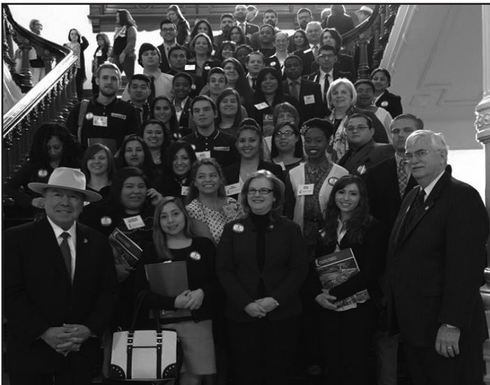
Students from Texas A&M Corpus Christi visiting the Capitol to discuss their higher education priorities with Senator Juan "Chuy" Hinojosa.

We invested $74.2 million in additional financial aid funding for our students striving for higher education, including $62.7 million for the TEXAS Grants program that will fund about 90% of all applicants. These funding streams give our South Texas students greater access to college resources, increases affordability, and strengthens our ability to train an educated and competitive workforce.