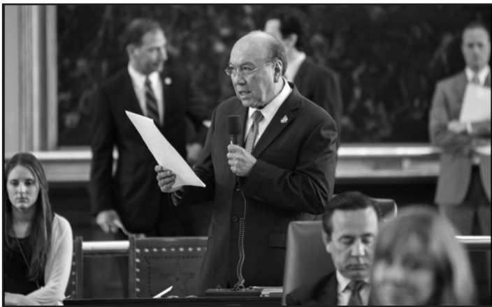
Senator Juan "Chuy" Hinojosa debating legislation on the Senate floor.

Water desalination, the process of converting salt water into fresh water so it is suitable for drinking and irrigation, may be the future of our water supply since nearly all of the Earth's water is salt water. This is why I sponsored and passed HB 2031 that allows for the diversion, treatment, and use of marine seawater for desalination. This significant legislation will streamline the regulatory process and reduce the time required for and cost of seawater desalination consistent with appropriate environmental and water rights protections.