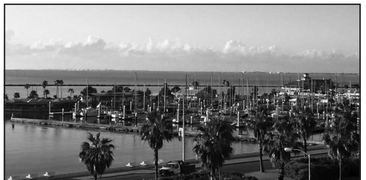
View of the Corpus Christi bay in Nueces County, Senate District 20.

Another critical piece of legislation for the coast came with Windstorm Insurance Reform. I worked with my colleagues to ensure that our families have access to affordable and accessible windstorm insurance coverage with a strong funding structure and an increased level of transparency and accountability.