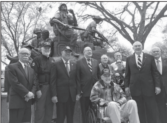
The Texas Capitol Vietnam Veterans Monument Dedication Ceremony honoring our fallen Vietnam Heroes and their families for their ultimate sacrifice of defending our freedom, and welcoming those who came home and fought with great courage and resilience.