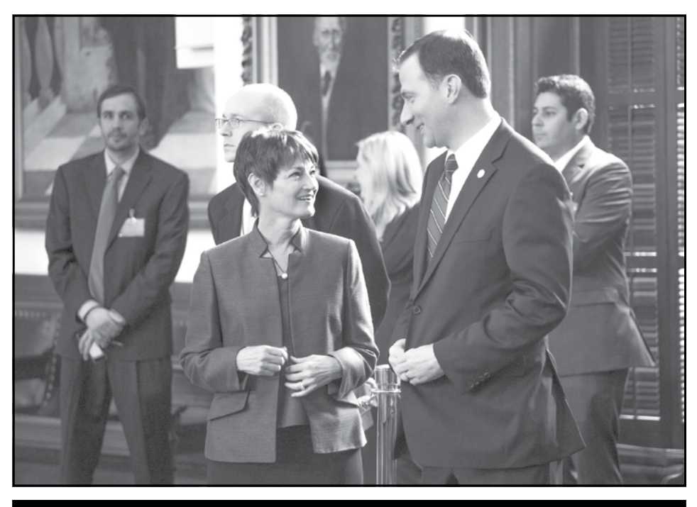
Sen. Donna Campbell speaks with Sen. Charles Schwertner on the Senate Floor. Along with Sen. Deuell, they represent the three physicians serving in the Texas Senate.

The budget for the next biennium is roughly $197 billion. Almost 38% of that will go to fund public education and 37% is dedicated for health and human services. Education received a $3.4 billion increase and state troopers will receive a pay raise over the next two years to recruit and retain DPS