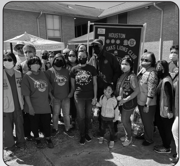
Senator Miles joins the Houston Oaks Lions Club during the COVID lockdown to help with a food drive for the local community.