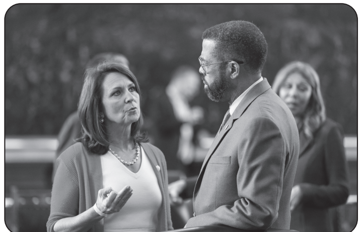
Senator Angela Paxton and Senator Miles discuss issues important to both of their constituencies: fixing our electrical grid.

The Texas Legislature created the Gulf Coast Rail District (GCRD) to enhance the economic benefits of rail, while improving the regional quality of life. With an anticipated addition of 4.2 million people and 1.6 million jobs by the year 2045, the eight county Houston-Galveston region will see an influx of millions of additional trips on its transportation network. Senate Bill 1990 allows the GCRD to construct Bus Rapid Transit projects which will facilitate important partnership opportunities in transportation for the greater Houston-Galveston region.