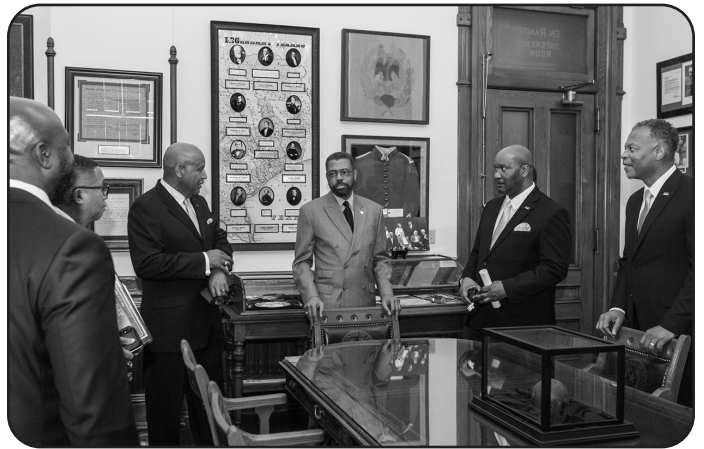
Senator Miles and members of 100 Black Men meet in the historic Civil Rights Room above the Senate Chamber to discuss strategy around various legislative issues this past session.

This session, Senator Miles led the fight for the US Board on Geographic Names to change the names of geographic features in Texas which contain the word "negro." Twenty years ago, the Legislature directed the Board to rename 20 geographic features in Texas all containing the word "negro." However, this was never accomplished. After passage of SCR 29, the Board voted to change these offensive names.