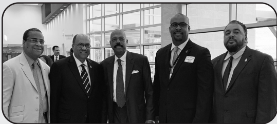
Senator Miles and fellow community leaders at the inauguration of the first class of the Miles Ahead Scholars. Male role models and mentors are a key component of the program, they show the young men of the Miles Ahead Scholars that anything is possible with hard work.