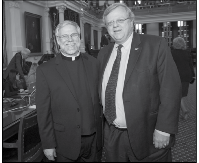
Senator Bettencourt, pictured on the Senate floor, with Pastor/Priest of the Day Father Troy Gately (St. John Vianney Catholic Church) of SD 7.

Cypress Creek Greenway Project - The Cypress Creek Greenway Project, in partnership with the Cypress Creek Flood Control Coalition, is working hard to improve the quality of life in the Cypress area by promoting a multi-use approach to land use within the Cypress Creek watershed. The master plan for this project includes a trail system connecting a series of existing and future anchor parks threaded along the Greenway. This multi-use approach will serve to alleviate flooding, provide recreational opportunities, and preserve the natural habitat across the entire Cypress Creek watershed.