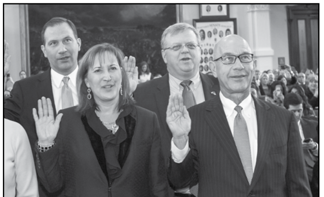
Senator Bettencourt being sworn in with fellow Senate Members.

Senator Paul Bettencourt Proudly Serving Senate District 7