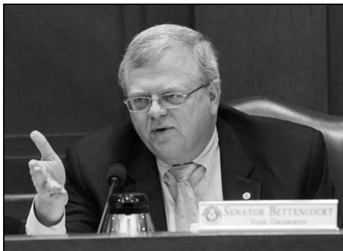
Vice Chairman Bettencourt discusses important issues before the Senate Committee on Intergovernmental Relations.

SB 1760 also requires the Comptroller of Public Accounts to provide a list of statewide property tax rates (for taxing units other than schools) each year, with the rates listed from highest to lowest. This will make it much easier for taxpayers to compare tax rates between neighboring taxing units. SB 1760 is a good first step in increasing the transparency and accountability of the property tax rate setting process.