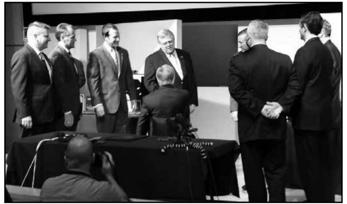
Senator Bettencourt with Governor Abbott at the HB 1 bill signing ceremony, where the Governor referred to Senator Bettencourt as the "Architect of Tax Relief."