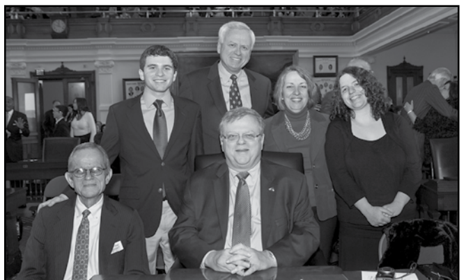
Senator Bettencourt poses with his family at his desk on the Senate floor.