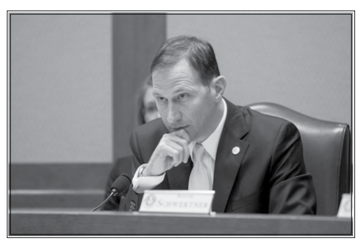
Senator Schwertner hearing testimony at the Senate Committee on Criminal Justice.

number of Texas charter schools from 215 to 309 by the year 2019. These new charter school programs will serve to improve innovation in our schools and increase educational options for parents.