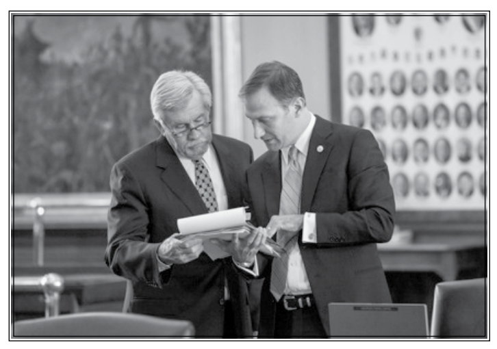
Senator Schwertner discussing legislation with Senator Troy Fraser on the floor of the Texas Senate.

Legislation which I co-authored (SB 8), attempts to address this runaway Medicaid spending by reducing waste, fraud and abuse, and ensuring that Medicaid services are being properly utilized. This important legislation will help protect taxpayer dollars and ensure state funds are only expended to provide