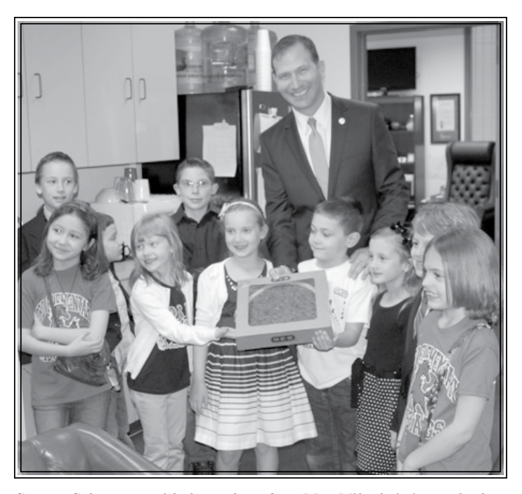
Senator Schwertner with the students from Mrs. Mikeska's 1st grade class.

As someone with six generations of farming and ranching roots in Texas, it was a great honor to serve on the Senate Committee on Agriculture, Rural Affairs, and Homeland Security this session. There I filed SB 1233, legislation to protect our state's farmers and ranchers from burdensome overregulation by the Texas Animal Health Commission (TAHC), while maintaining the critical safety measures needed to protect the public from a dangerous animal disease outbreak. With the help and support of numerous agriculture groups, including the Texas Farm Bureau, the Texas and Southwestern Cattle Raisers Association, the Texas Poultry Federation, and the Independent Cattlemen of Texas, SB 1233 was passed and signed into law by Governor Perry.