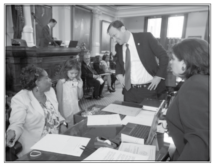
Senator Schwertner working on the floor of the Texas State Senate.

Additionally, my colleagues and I made a renewed commitment to relieving our state's overburdened mental health system, adding $260 million in new funding for the upcoming biennium. This additional funding will serve to reduce waitlists, provide for prevention and early identification measures, and increase public access to mental health services.