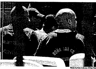
Below, three Norte Azteca gang members were led into a courtroom after they were sentenced to life in prison Tuesday in federal court. Top, heavily armed FBI agents searched Norte Azteca gang members.

The indictment, obtained through a search of the district court records, said the defendants were actively involved in the Norte Azteca gang, including a murder, the indictment said. The defendants were charged with racketeering, conspiracy and other crimes, including a murder, the indictment said. The defendants were charged with racketeering, conspiracy and other crimes, including a murder, the indictment said.